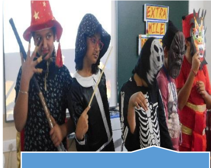
Extra Mile Program