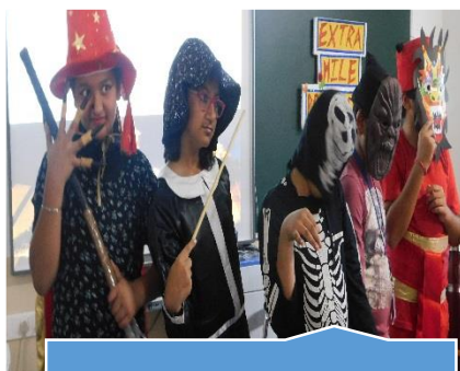
Extra Mile Program