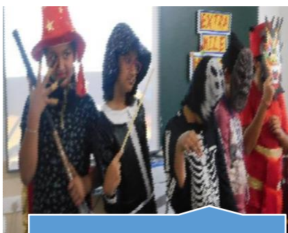
Extra Mile Program